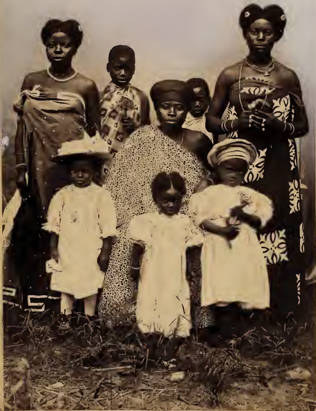
Mpongwé Family Libreville ; Gaboon. W. Af.